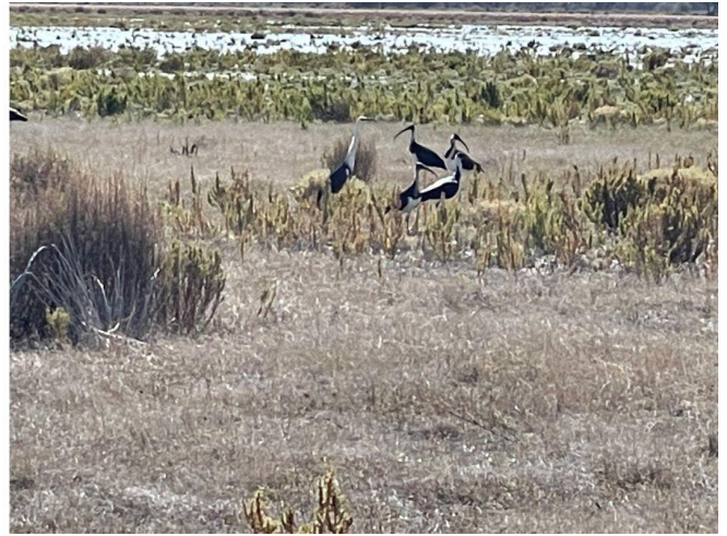
Left to right. Picture 1: Grey teal at borrow pit, Tanyaca Horseshoe. Picture 2: Herons and straw necked ibis at Tanyaca Horseshoe.